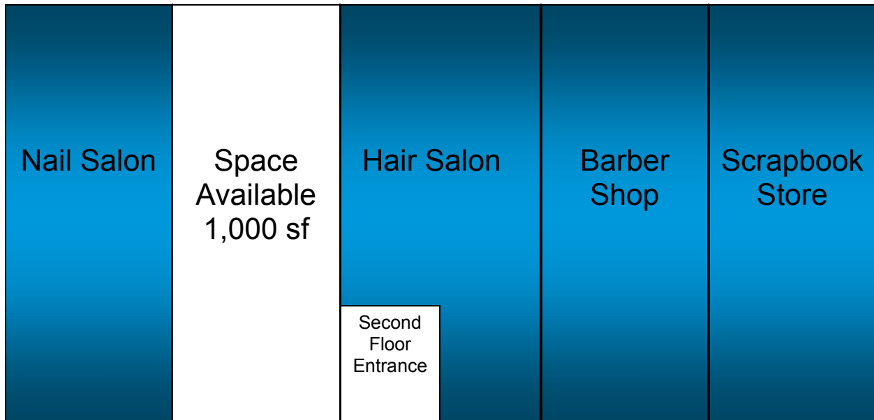
FIRST FLOOR RETAIL