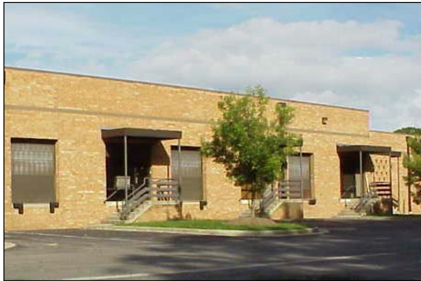
REAR LOADING DOCKS