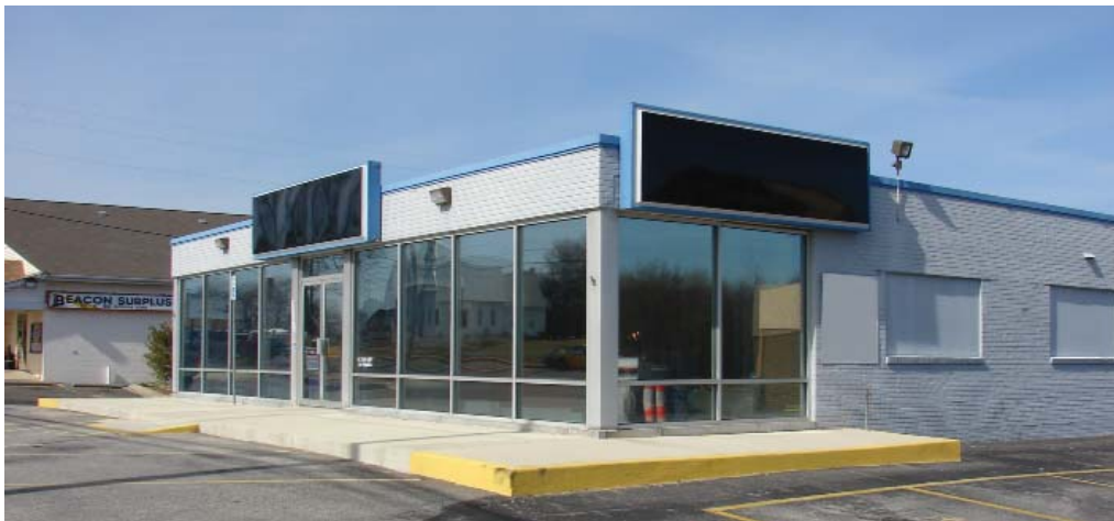
6,000 SF RETAIL BUILDING OFFICE/SHOWROOM