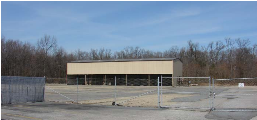
5,000 SF STORAGE SHED