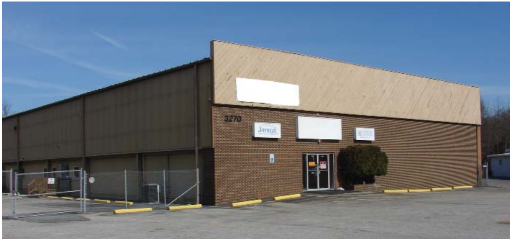
15,300 SF WAREHOUSE WITH 5,000 SF OFFICE/SHOWROOM